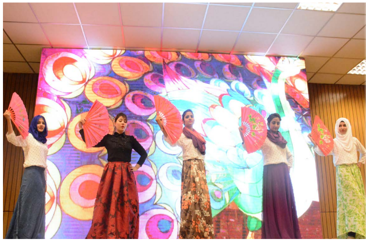
SIR SHAHNAWAZ BHUTTO AUDITORIUM, SMIU: Female students of SMIU presenting cultural dance of China Republic.

The participants performed the traditional dance performances on Chinese fan dance, South Asian "dandiya" dance, Arabic "dabke" dance, African mask dance, Central Asian "whirling" dance. "Qawali" and Italian poetry were also recited. Students on national cultural performance