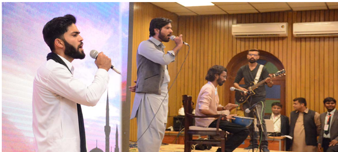
SIR SHAHNAWAZ BHUTTO AUDITORIUM, SMIU: A group of students performing a musical item in Battle of Tansen.