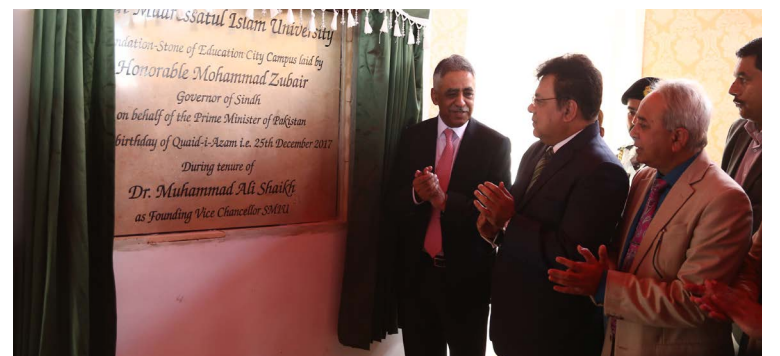
MALIR: Governor Sindh, Muhammad Zubair laid the foundation stone of SMIU's new Malir campus.

"It is indeed great honour for me to be in this ceremony when the Sindh Madressatul Islam University is beginning construction of its new campus. It is one huge occasion that the Prime Minister is presiding over a function for another mega project of the Islamia College University and I am here on his behalf doing the same in SMIU."