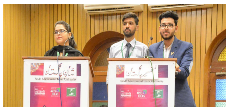
SIR SHAHNAWAZ BHUTTO AUDITORIUM, SMIU: Participants of the quiz while answering questions.