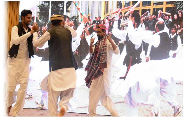
SIR SHAHNAWAZ BHUTTO AUDITORIUM, SMIU: Dhamal, traditional folk dance was performed by the male students of SMIU.

The audience lauded the efforts of the participants. At the end of the program, an