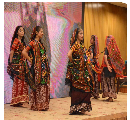
KARACHI: Students of SMI Model School also took part in the festival of Arts and Ideas by presenting a show on Quaid-e-Azam Karachi mein, quiz, folk performance in Sindhi, Mazahiya Musharia in Urdu and Sindhi Boli, a Sindhi tableau on December 9, 2017.