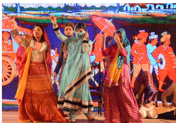
INNER COURTYARD, SMIU: A beautiful scene from the play 'Noori Jam Tamachi.'