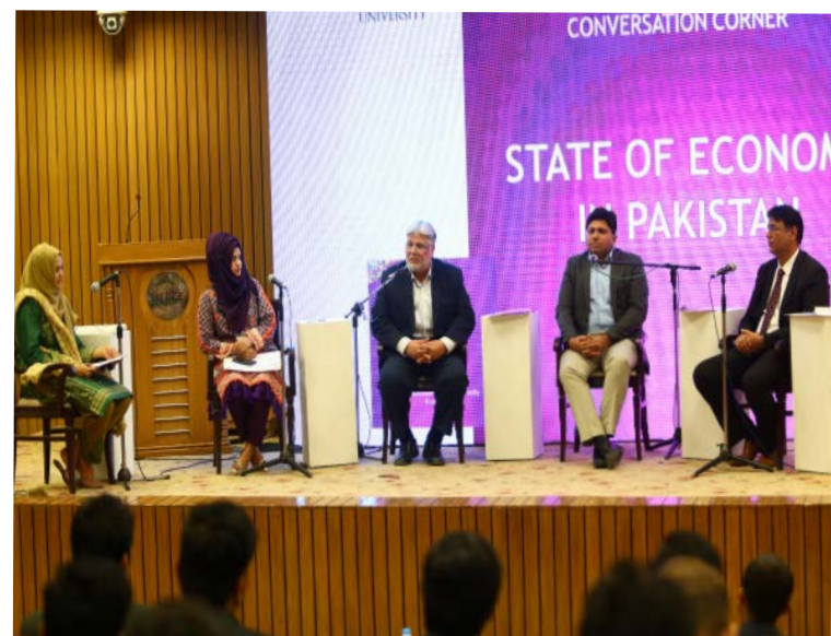
SIR SHAHNAWAZ BHUTTO AUDITORIUM, SMIU: The panelists discussing the state of economy in Pakistan.