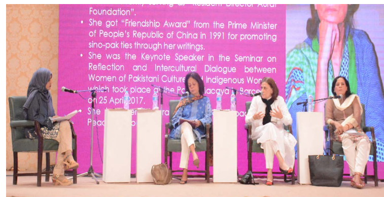
INNER COURTYARD, SMIU: The panel discussed gender related problems.