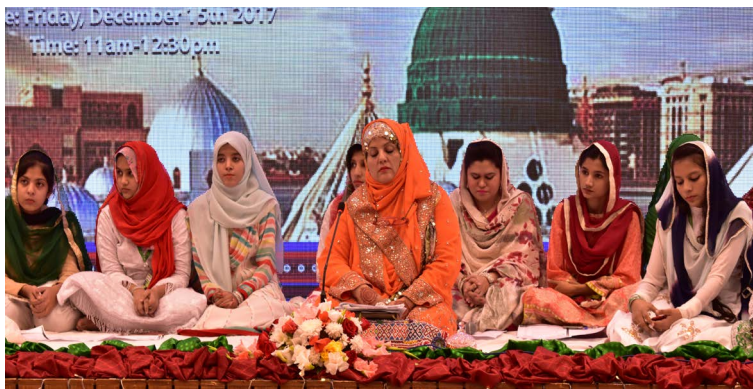
SIR SHAHNAWAZ BHUTTO AUDITORIUM, SMIU: Female faculty and students while participating in the Milad.