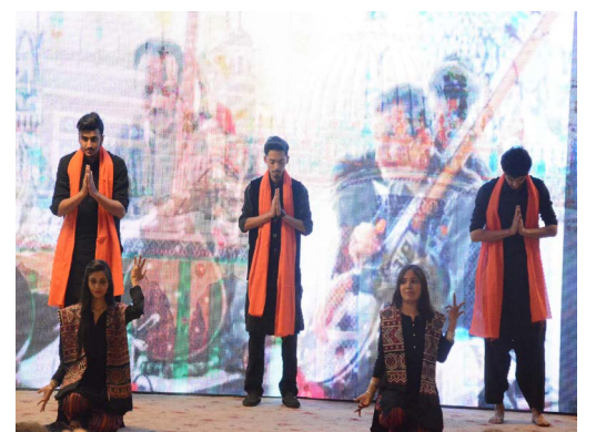
SIR SHAHNAWAZ BHUTTO AUDITORIUM, SMIU: Kalam of Bhitai was presented in the form of performance by students.