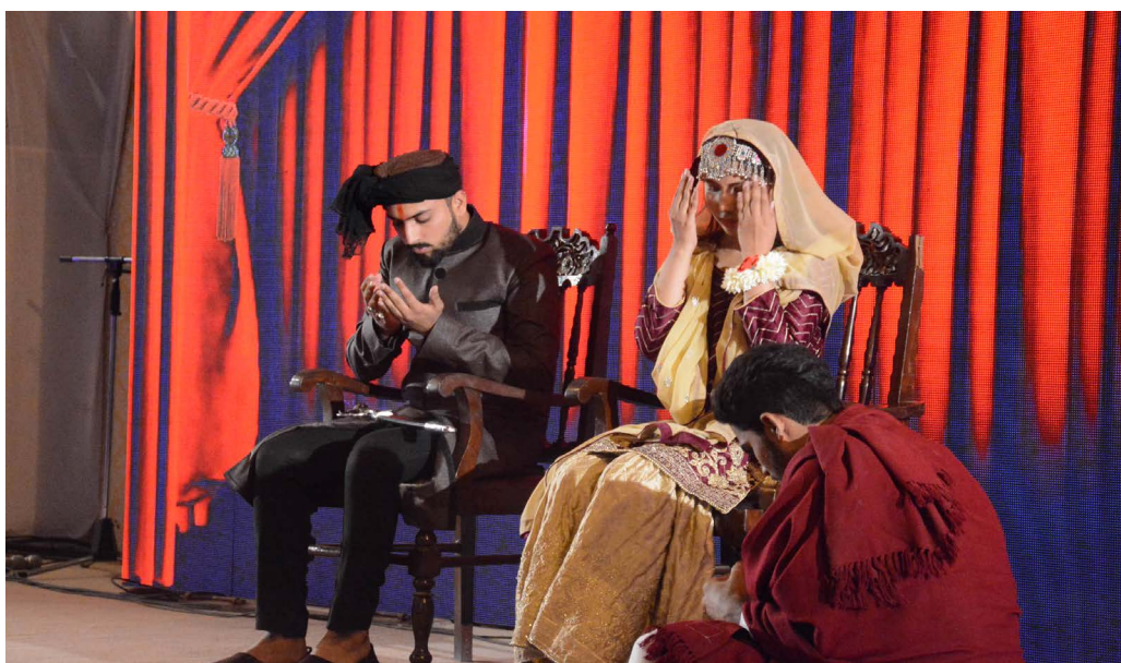
INNER COURTYARD: A scene from the play 'Lilan Chanesar.'