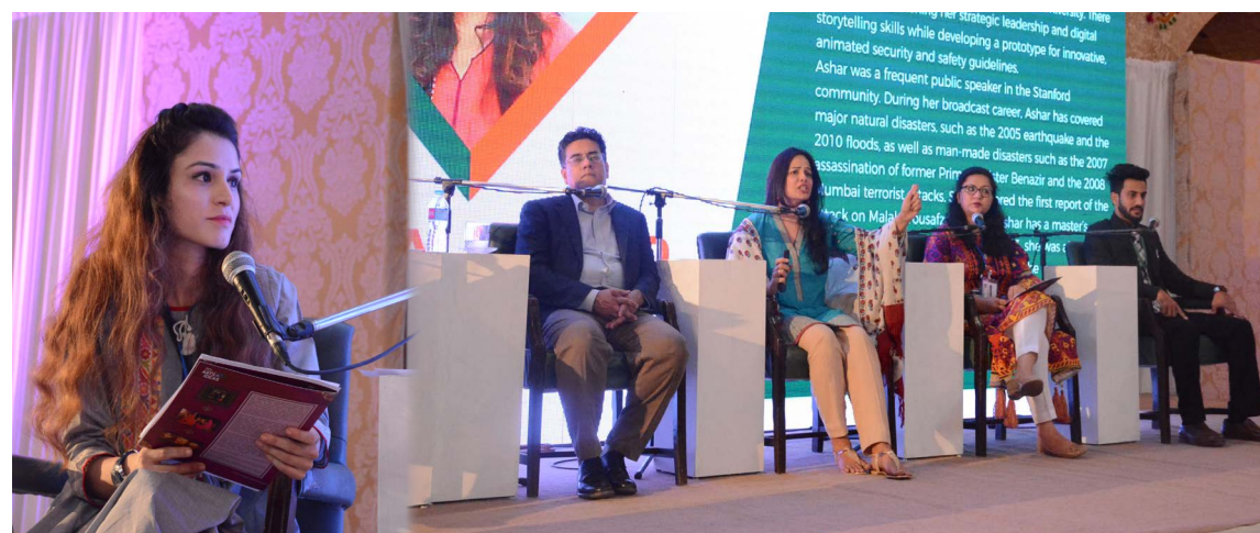
INNER COURTYARD, SMIU: The panel questioned the maturity of digital media.

In the end of the event, students were asked to question the guest speakers.