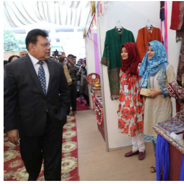
SMIU: SMIU VC visiting stalls on the first day of Festival of Arts and Ideas.

Funfair was the crowded area throughout the three days of the festival.