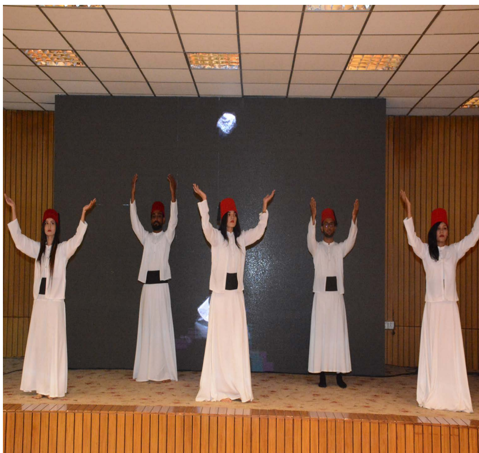
SIR SHAHNAWAZ BHUTTO AUDITORIUM, SMIU: The students performing Rumi's whirling dance.

The verses instilled the spirituality in the hearts of the listeners. Program ended with loud cheers and applause by the spectators.