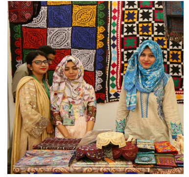
SMIU: Female students pose for the photo on their stall.