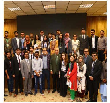
SIR SHAHNAWAZ BHUTTO AUDITORIUM, SMIU: A group of participants, organizers and jury of documentary competition of Festival of Arts and Ideas.