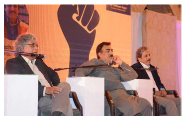
INNER COURTYARD , SMIU: The panelists discussing freedom of media in Pakistan.