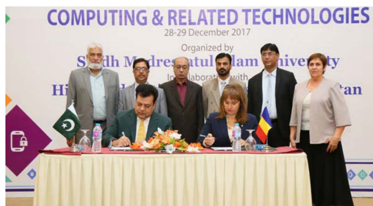
KARACHI: MoU signing between SMIU and one of Romanian universities is underway.

The Conference covered the topics including Computer architecture and design, Artificial intelligence, Pattern recognition, Human computer interaction, Computer networking, Software engineering, Data management, DataC