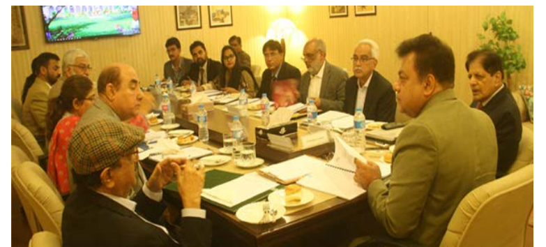
CONFERENCE ROOM, SMIU: 15th Meeting of SMIU syndicate in progress.