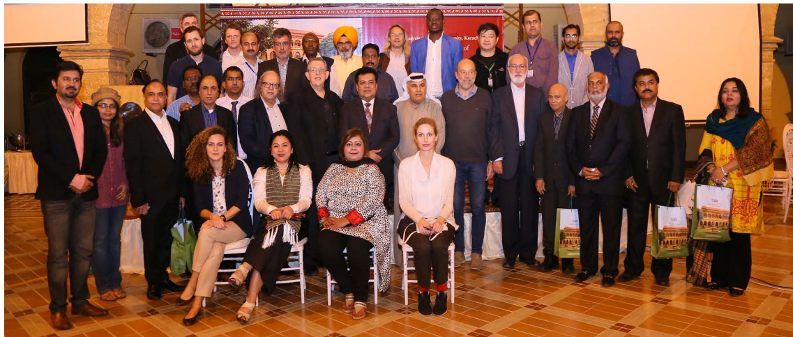
INNER COURTYARD, SMIU: Sindh Madressatul Islam University hosts a reception in the honor of the delegation of International Media Conference, on January 8 at inner courtyard of Main Building of the university. Journalists of more than 24 countries along with senior journalists of Pakistan attended the reception. Report on Page 10