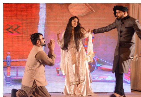
INNER COURTYARD: A scene from the play 'Sorath Rai Diyach.'