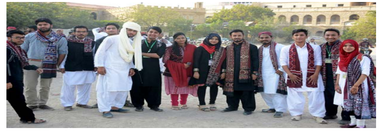
SMIU: Students pose for picture while clad in Sindhi cultural dress.