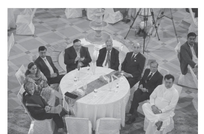
GUESTS of the night enjoying performance of students.

thoughts and wisdom, and Ideas (in December 2017), in