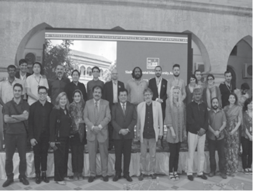
A group photo of APFF's delegates.

thentic and innovative cultural phantasmagoria resonating the curiosity, imagination and aesthetics of Karachites.