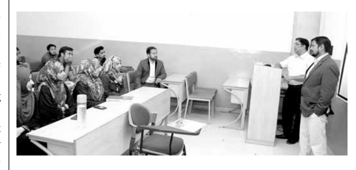
GUEST speaker while addressing the students.