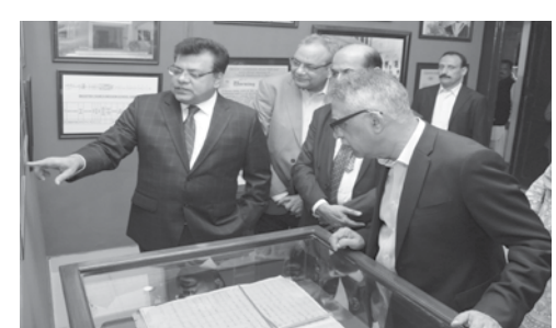
SINDH Governor visiting the Jinnah Museum.