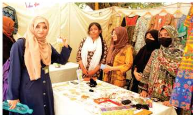
A group of the students displayed cultural dresses during the Students' Festival 2022.