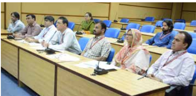
The Quality Assurance Division Islamabad organised an online session for clarification of the new graduate policy 2023. At SMIU, the Deans, Director of Post Graduate Programs, Registrar, heads of departments and faculty members participated in it on the invitation of the QEC, SMIU.