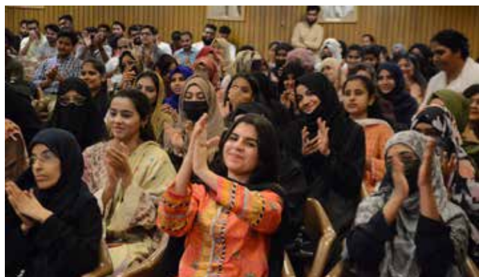
Newly enrolled students attending Orientation Day for Fall 2023, held on September 14, 2024 at the auditorium.