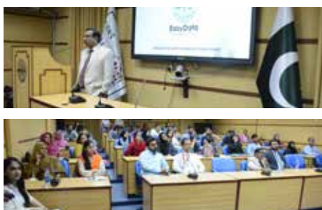
Sindh Madressatul Islam University's faculty members and students attending the session on Easy Data, held on October 25, 2023 at SMIU's Senate Hall.