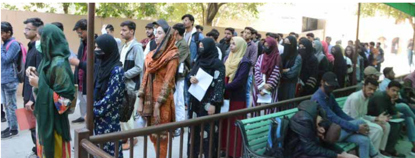
Candidates thronged at SMIU for Admission Test for session Spring 2024, on December 24, 2023.